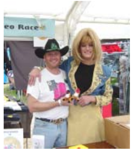
ILGRA Rodeo 2006 Congratulations!